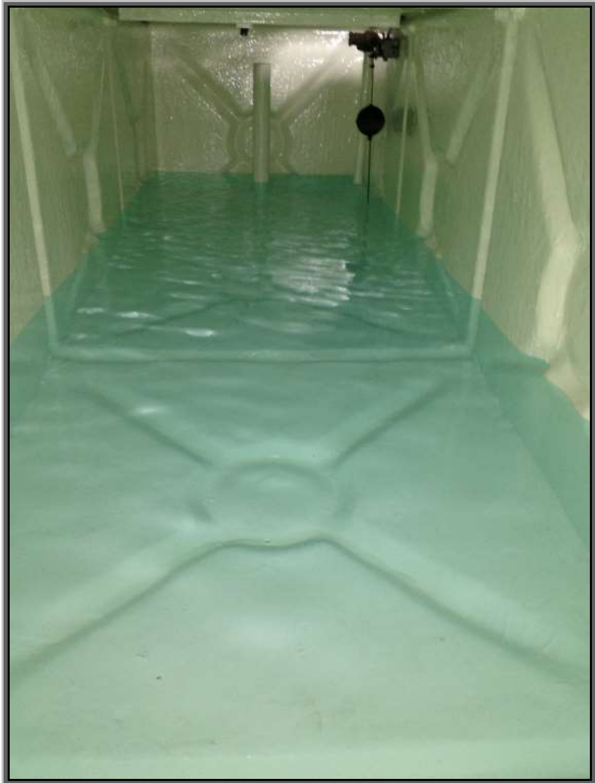
Cold Water Storage fully disinfected and filling up before been returned to full service