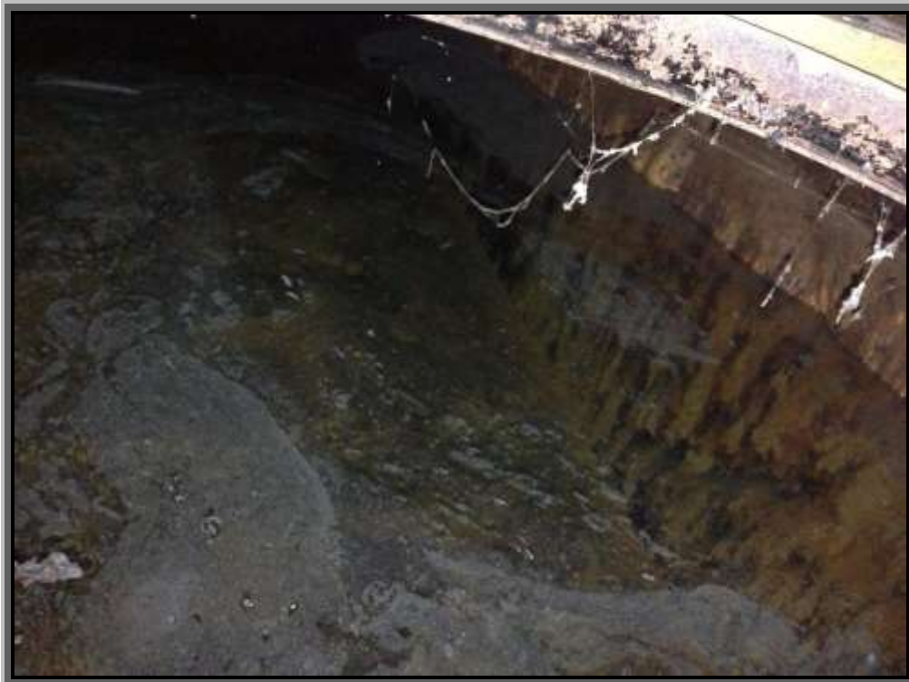
Internal condition of cold water storage tank before the system is drained