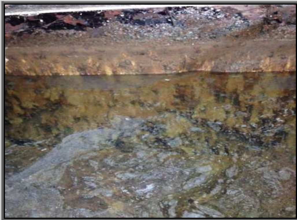
Stored domestic water prior to any works taking place