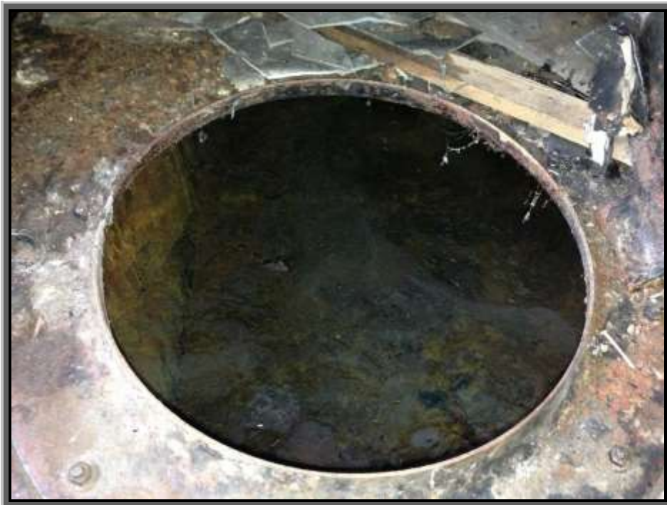
Internal inspection before preparation works commenced